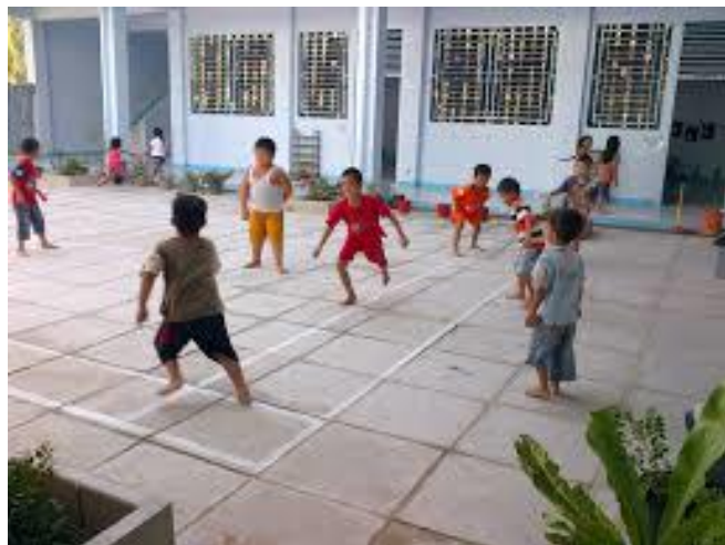
Figure 1. Slodoran - A Local Game

The composition of the local wisdom-based parenting model comprises: a description; an explanation; cultural values; an evaluation, and feedback. The descriptions contain brief explanations from the model's theme, with characteristics of philosophical values or games. Based on Figure 1, for example, Slodoran traditional game is a game comprising two groups of three - to play or guard the fort against the enemy seeking to enter. The explanation contains detailed information on the theme. The cultural values explain the intrinsic aspects of the games' themes.