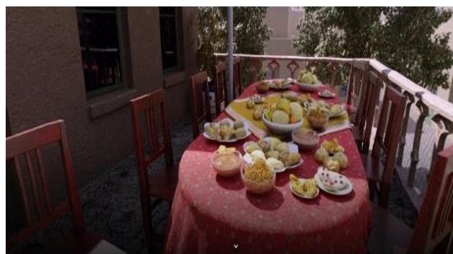
Figure 2: Festival of Lights (Screenshot)