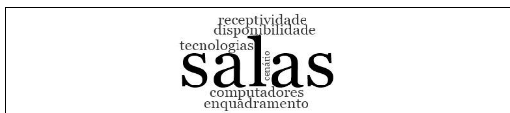
Figure 2: Most accounted terms in the Lack of Conditions subcategory.

"there is always that daily problem of: today there is one that does not work; the keyboard was broken; or any other problem." (teacher "Vitória", L. 64-66).