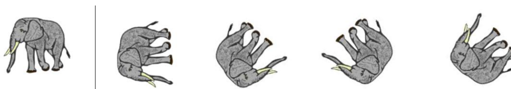
Figure 1: Example item of the picture mental rotation test.

right side. Two of the four items on the right side were identical (non-mirrored) but picture plane rotated versions of the target item on the left side ( 45^\circ , 90^\circ , 135^\circ , or 225^\circ rotated compared to target item). The other two items were mirrored versions (see Figure 1). The children's task was to cross out the two correct items on the right side. There was a time limit of two minutes. There were two items provided as examples and two more items for practice before the test began. Rotation performance was defined as the number of correctly solved items in the PMRT.