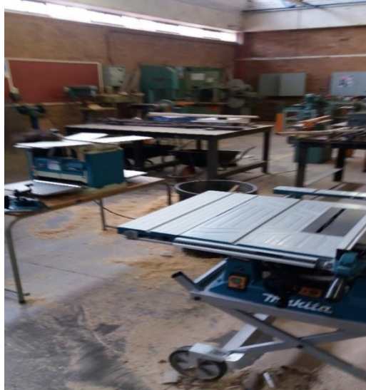
Figure 3: Teacher F's workshop

With regards to the physical layout of Teacher F, there was evidence to prove that the workshop was functional; since there was also sawdust in the workshop, showing that learners had used it before .(See Figure 3 below):