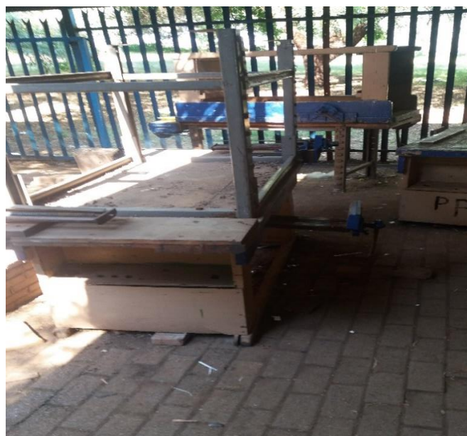
Figure 2: Teacher A's outside workshop

Teacher A's note that learners were no longer interested in woodwork was verified by the workbenches that were left outside, thereby showing that they do not use them any more, (Refer to Figure 2 below):