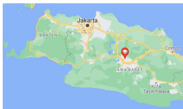
Figure 1. Location

This study included students from a well-known public university in Bandung, West Java, Indonesia. These students took civic education courses. The students were given a statement of willingness to participate in this study by the lecturer who taught the course. Several criteria were used to select the participants. First, they were students enrolled in civic education courses. Second, they completed the survey form. Third, they had expressed their willingness to participate in a series of activities until the study was completed. Based on these criteria, 120 participants were selected, with 70 males and 50 females. Based on these criteria, purposive sampling technique was used as a sampling selection technique. Meanwhile, in determining the interviews, criteria were set for those who faced difficulties in the learning process. Through these criteria, three students were interviewed to explore their perceptions and experiences in the process and stages of the actions given.